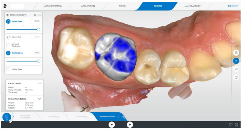
The initial crown proposal, no tools needed to be opened to edit this restoration because the initial proposal was perfect.