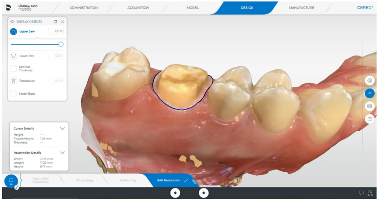
Side view of the initial model. The margin did not need to be edited.