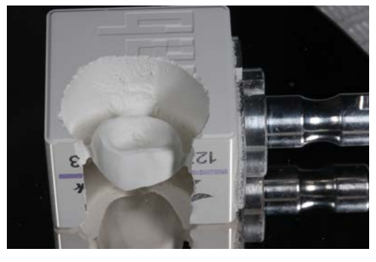
Milling time 8:35 min.