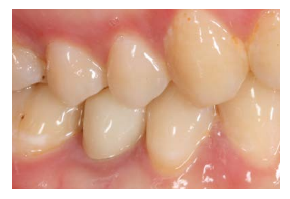
First try in after sintering in CEREC SpeedFire.