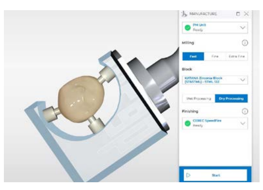
Milling mode: fast - to have more time for postprocessing. Material: Katana Zirconia STML A3.