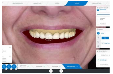
Design tools are used to do small touchups in the CEREC Smile Design application.