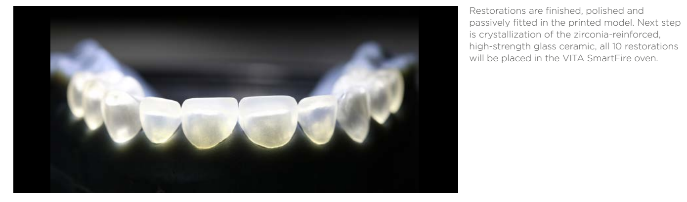
is crystallization of the zirconia-reinforced, high-strength glass ceramic, all 10 restorations will be placed in the VITA SmartFire oven.