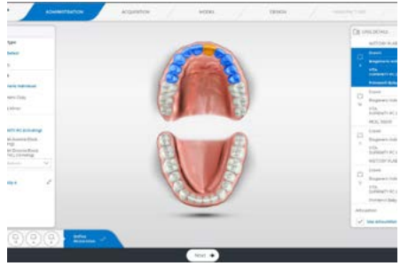
Open CEREC 5.1.1 Software and on Administration phase we add restorations and the material to be used in this case was selected: VITA Suprinity PC.