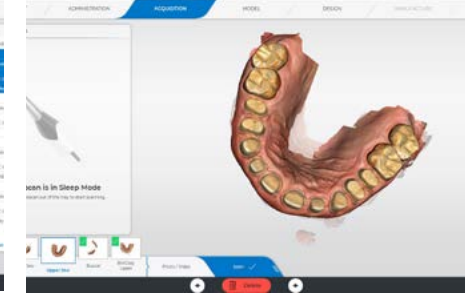
Full arch scan was taken of the preparations, and from mock-up adding a Biocopy folder.