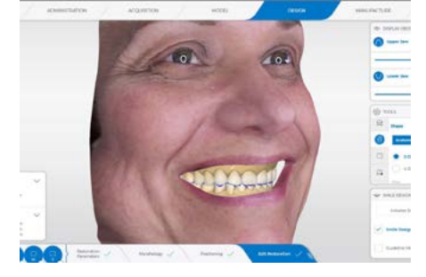
After the initial proposal, the CEREC Smile Design application was activated to finalize the design of the restoration using the patient's face and smile.