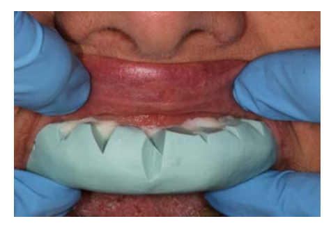
Initial impressions: CEREC Primescan was used Emotional mock-up is transferred to patient teeth, after patient approval we were ready to start the proposed treatment.