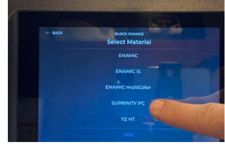
The new CEREC Primemill was used for the grinding of the restorations. Entering block information using the CEREC Primemill digital touchpad.