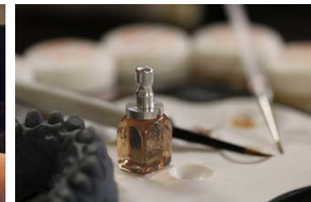
Vita Suprinity PC was selected for the restorations. Suprinity is a zirconia reinforced, high-strength glass ceramic with strength of 541MPa. Precise results thanks to material blanks with high edge stability and most important I like the high esthetics thanks to integrated translucency, opalescence and fluorescence.