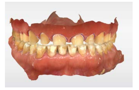
Upper and lower digital models articulated ready for Design phase.