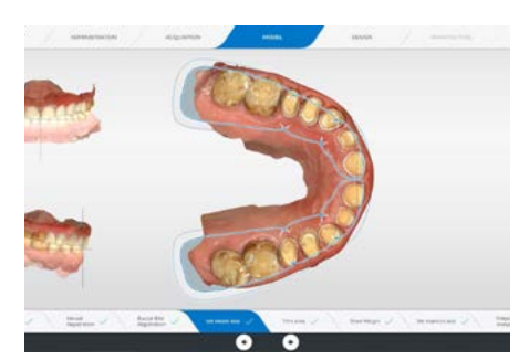
Setting the model axis and insertion axis are key for best grinding of restorations in the manufacturing phase.